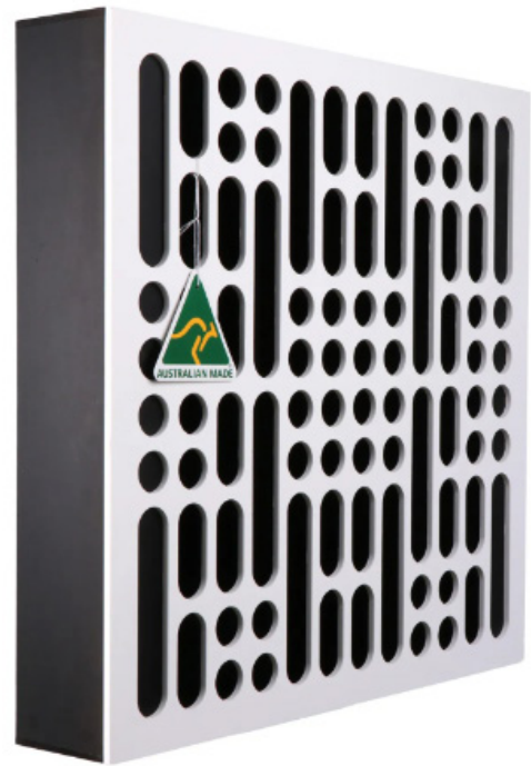
Metric 550 Acoustic Diffuser