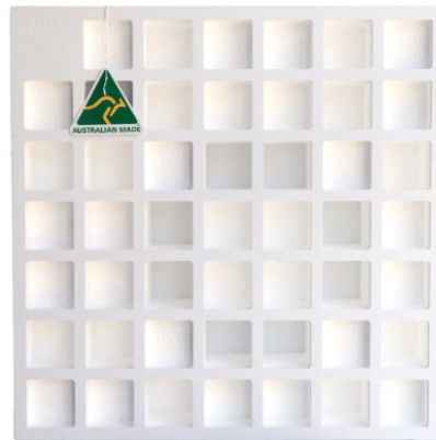
Dimetric 550 Acoustic Diffuser

Due to constant innovation, Specfurn products may be subject to design and specification changes without notice. Copyright © Specfurn 2022