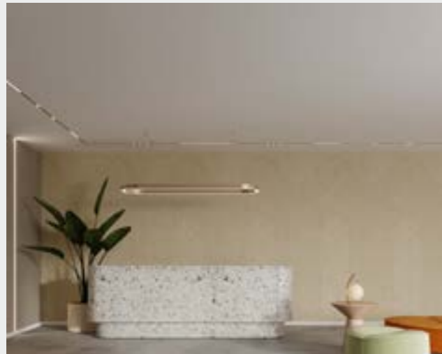
Fracture Wall Panels