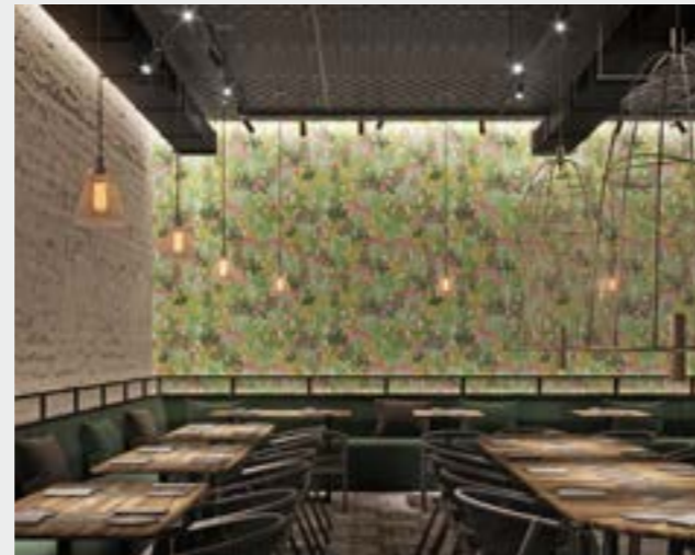
Printed Acoustic Wall Panels