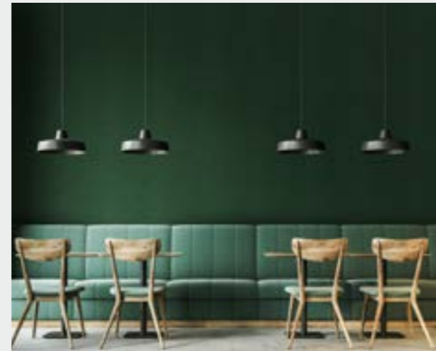
Full Color Acoustic Wall Panels